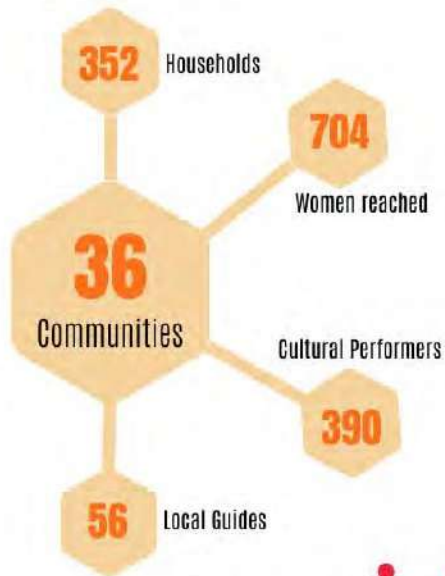
Overall value generated for the Communities